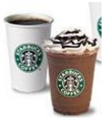
Coffee Provided by Starbucks

Many thanks to our local merchant supporters for refreshments at our meetings and door prizes for attendees.